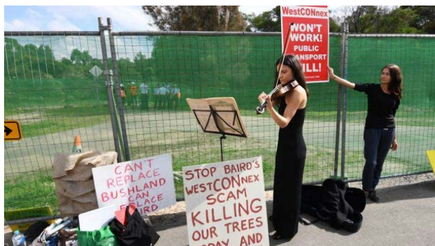
Requiem for a forest: Protesters at the Wolli Creek site

Protesters brought a temporary halt to clearing of rare ironbark woodland earmarked for the WestConnex project in Sydney's south.